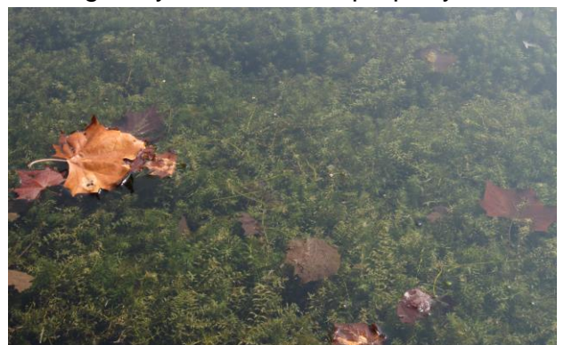
Dense mat of hydrilla in Croton River; Photo: C.McGlynn, NYSDEC

In addition to producing seed, hydrilla has green overwintering buds called turions and tubers that grow at the end of the roots and store energy. New populations of hydrilla can sprout from any of these, as well as from plant fragments that easily break off from the main plant. Turions, tubers, and plant fragments can be carried by currents or boats, boat trailers, and fishing gear to new locations.