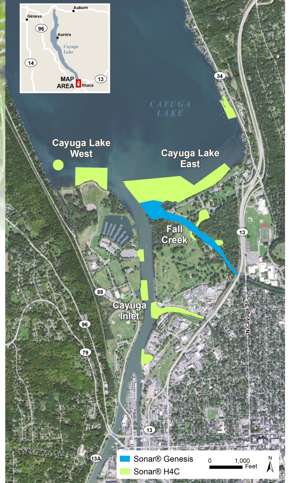
Figure 1 2022 Project Area Map