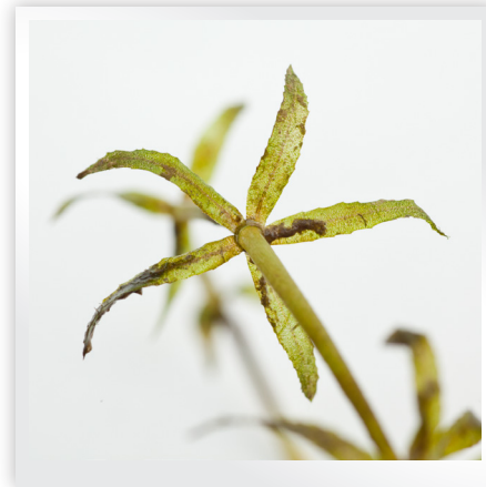
Hydrilla whorls up close

Hydrilla is a very aggressive aquatic invasive plant native to Korea. It is a submerged aquatic plant that is typically rooted in shallow water, with long stems that can grow up to 30 feet in length and up to one inch per day. These stems branch at the water's surface and grow horizontally, forming thick, dense mats. Hydrilla also produces tubers, small potato-like structures, which store food for the plant and also allow it to overwinter in the substrate of the waterbody and sprout in the spring.